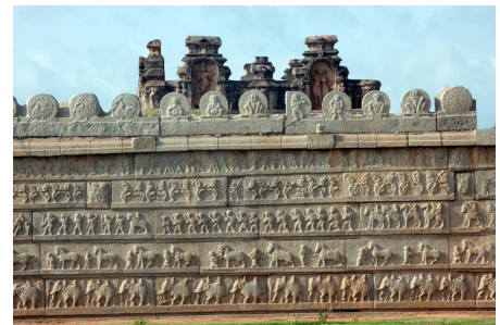
Hazara Rama Temple